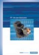
Schrack PT Relays