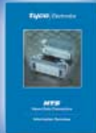
HTS Heavy Duty Connectors