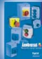
Industrial Control Stations