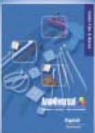
Cable Ties & Bases