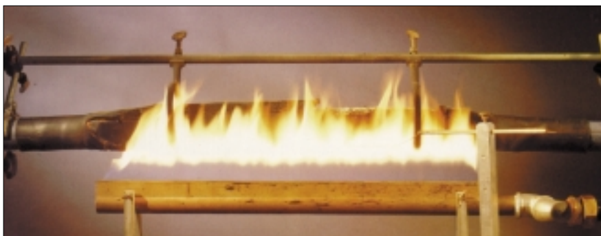
Photo 5: A fire-resistant Raychem joint maintaining its electrical integrity for more than 180 min. during a fire test according to IEC 60331.